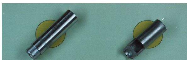
Welded tungsten crucible